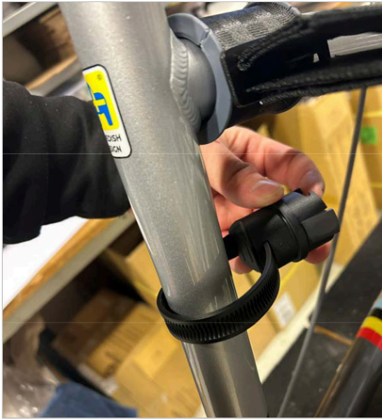
⑤ Insert the end of the strap into the bracket.