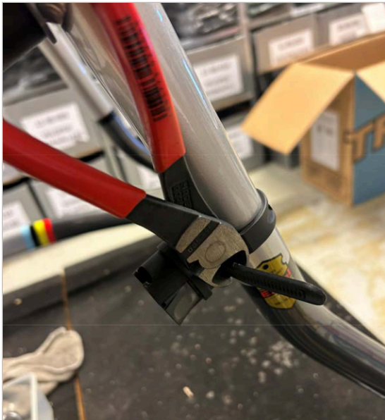
⑦ Cut off the excessive length of the strap with a cable cutter or knife.