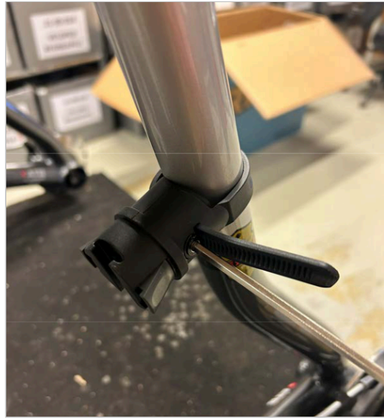
⑥ Tighten the screw/strap with the 4 mm allen key until the strap is tight.